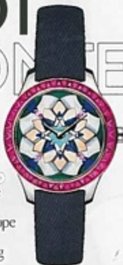
White, rose, and yellow gold, pink sapphire, pearl, diamond, turquoise, and lapis lazuli watch on denim strap, DIOR TIMEPIECES, price on request, call 800-909-DIOR

91 ACCESSORIES A denim strap lends everyday ease to the lavish colorscape of Dior's Grand Soir Kaleidoscope timepiece, with its light-reflecting mother-of-pearl, gold petal, and precious stone-embellished dial.